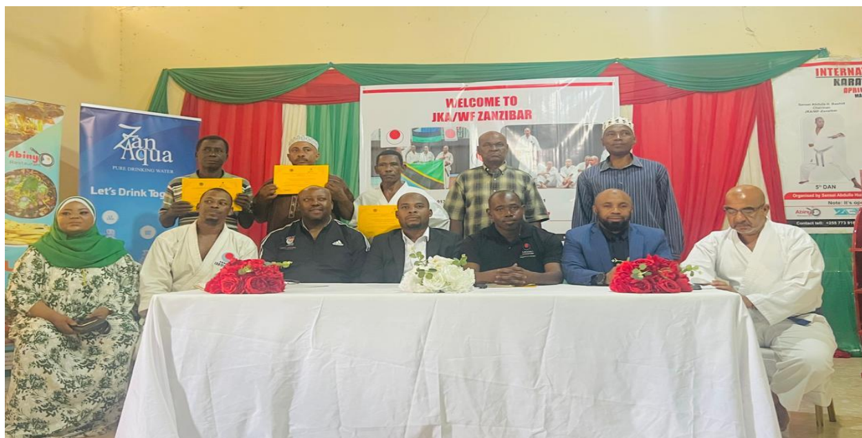
Figure 12: INVITEE FROM DIFFERENT DOJO AFTER RECEIVING THE CERTIFICATE FROM JKA/WF ZANZIBAR