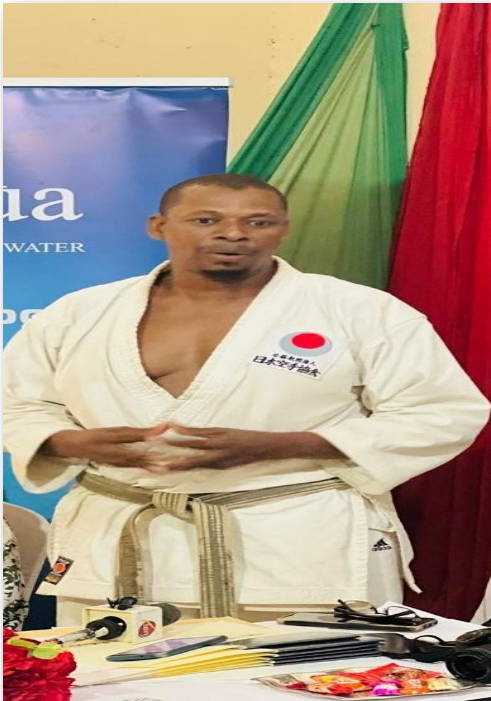
FIGURE 11: CHAIRMAN OF JKA/WF ZANZIBAR GIVE OUT SHORT EXPLANATION ABOUT JKA/WF ZANIBAR