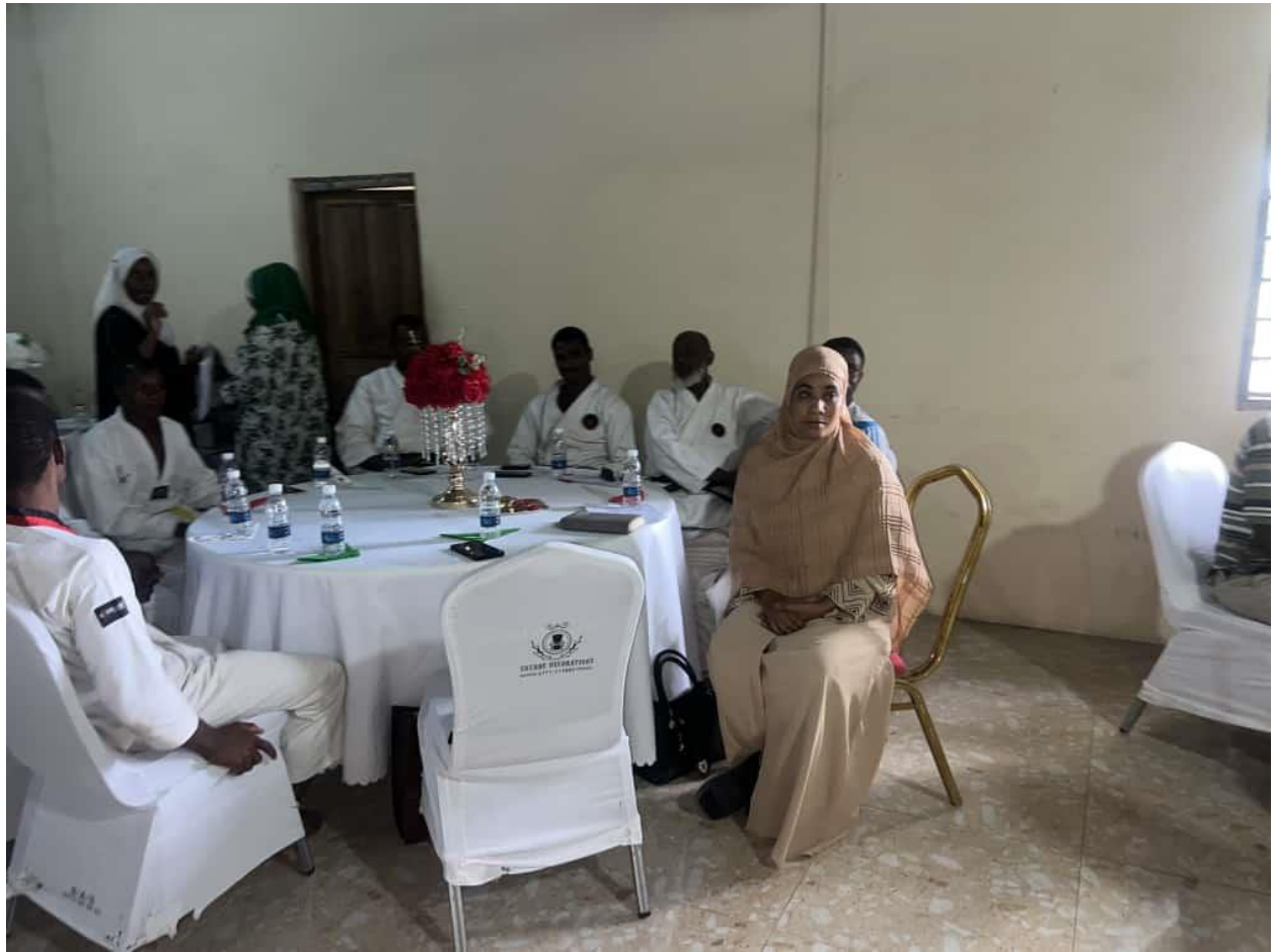
FIGURE 14: INVITEE OF THE EVENT