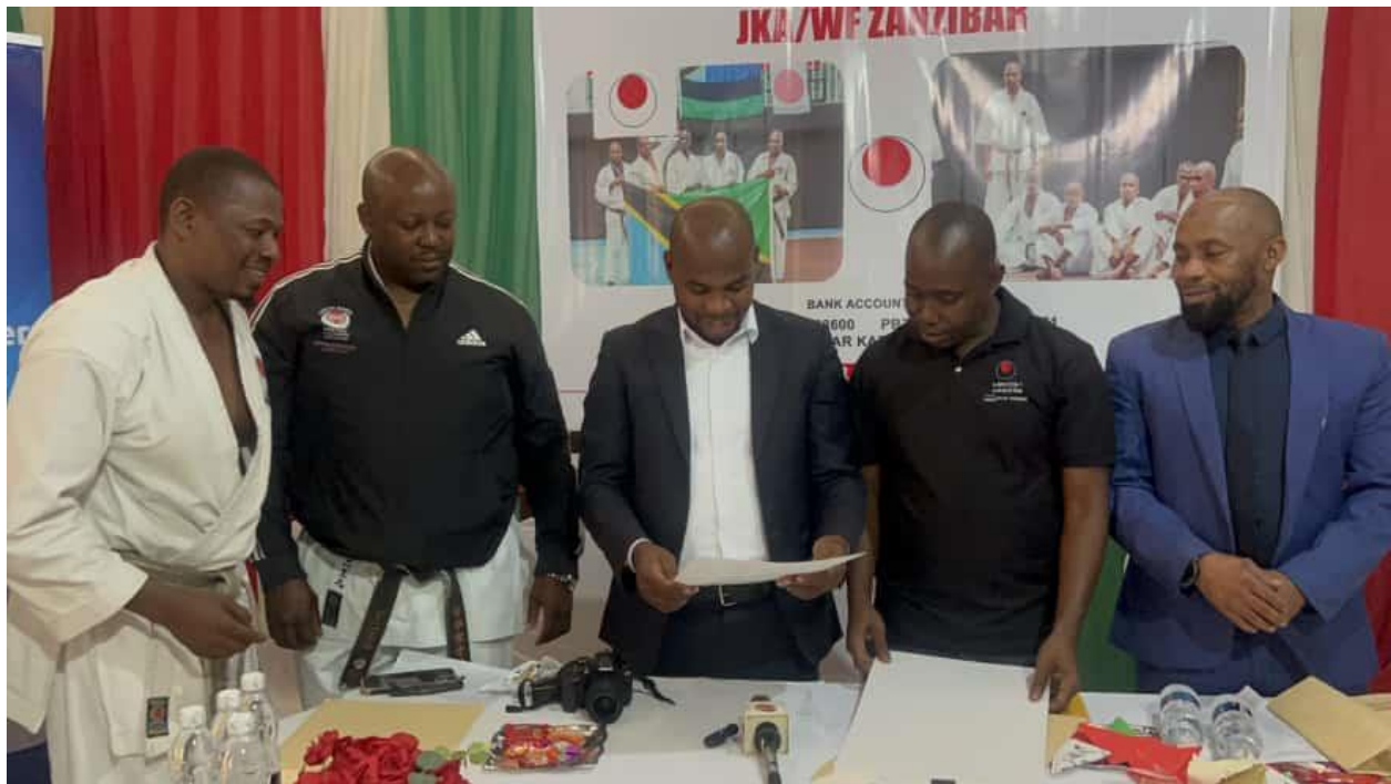
FIGURE 5: THE SECRETARY OF THE ART COUNCIL OF ZANZIBAR AWARDING THE JKA DIPLOMA TO STUDENTS WHO GRADED ON APRIL 2024 OF JKA/WF EXAMES.