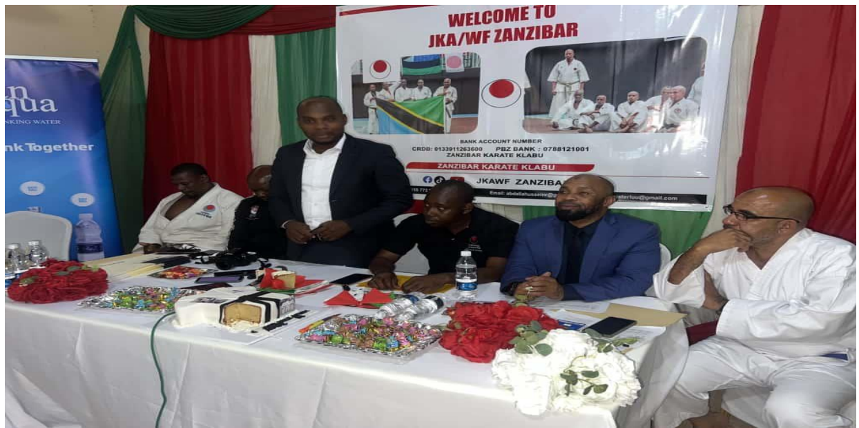
FIGURE 9: THE SECRETARY OF THE ART COUNCIL OF ZANZIBAR GIVE OUT HIS THANK TO JKA/WF ZANZIBAR FOR DOING WELL IN THE FIELD OF KARATE.