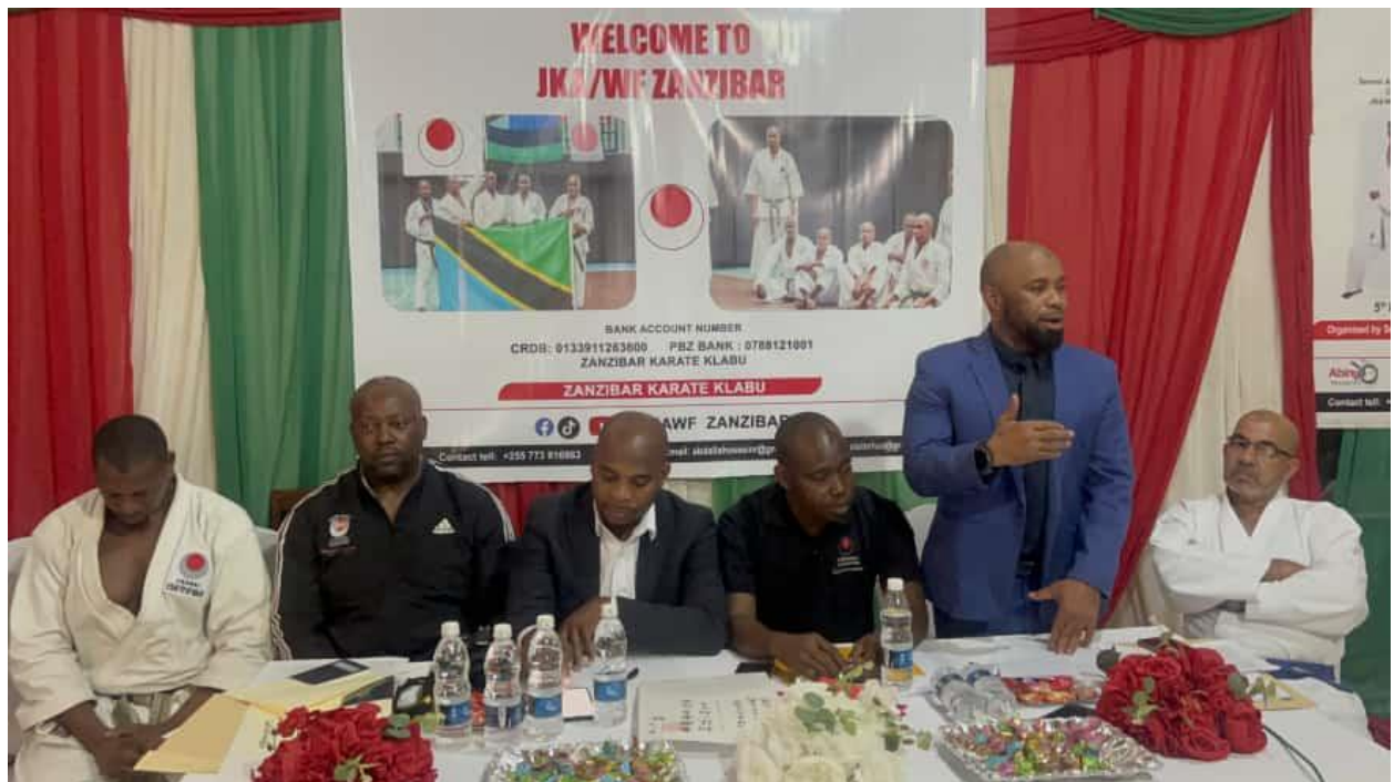
FIGURE 10: YOUTH AMBASSADOR WHILE GIVING OUT HIS SHORT EXPLANATION AND THANKS ON JKA/WF ZANZIBAR EVENT.