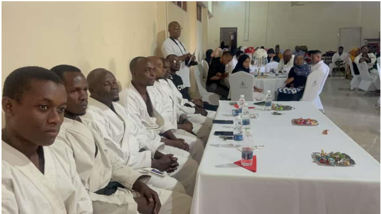
FIGURE 4: JKA/WF ZANZIBAR'S STUDENTS WAITING FOR THEIR CERTIFICATES.

The occasion was attended by the Secretary of Art Council of Zanzibar as well as the Youth Ambassador of Zanzibar, both of whom expressed their appreciation of the importance of karate in society. They emphasized that with Prayer, Hard work, and Determination (PHD) anything can be achieved.