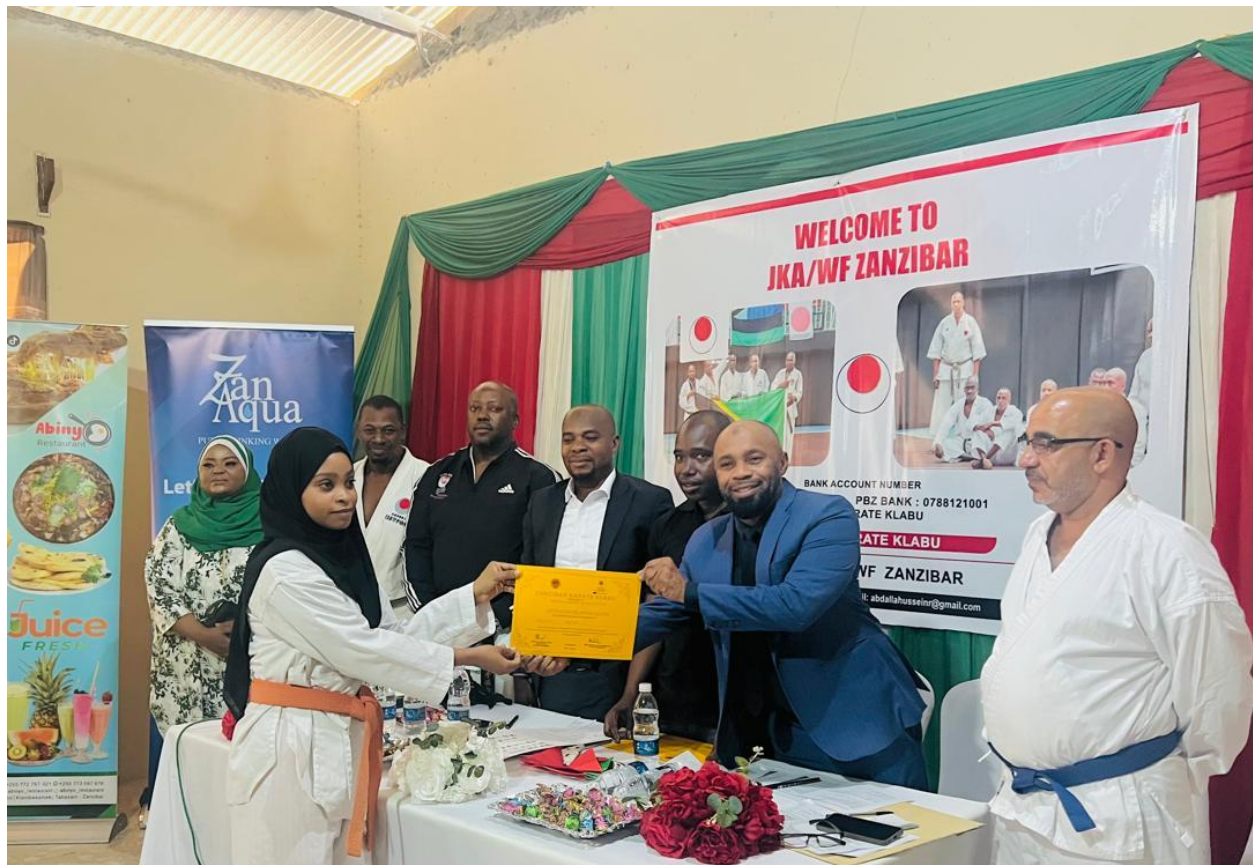
FIGURE 8: YOUNG UNIVERSITY FEMALE KARATE STUDENT RECEIVING HER SPECIAL CERTIFICATE AS REWARD.