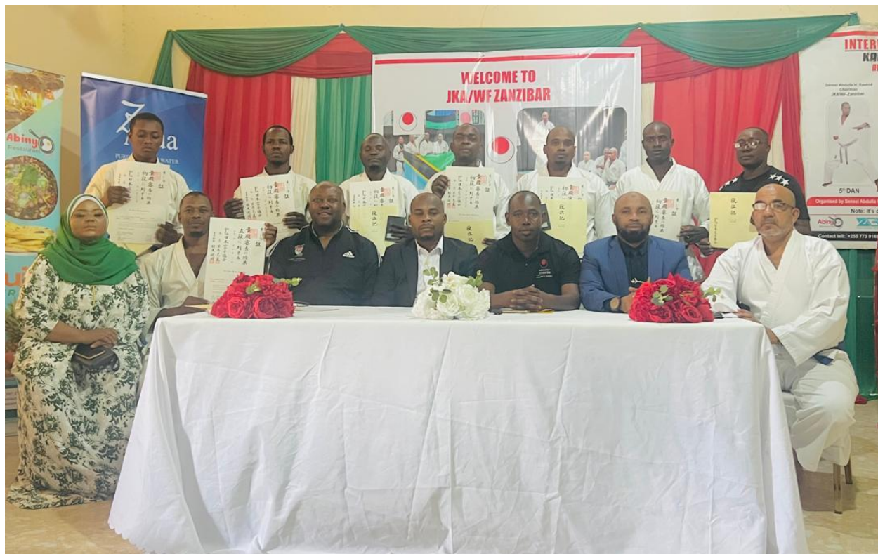
FIGURE 7: SIX JKA/WF ZANZIBAR'S STUDENTS AFTER RECEIVING 1 st DAN JKA/WF CERTIFICATES WITH HIGH TABLE OF THE CEREMONY.